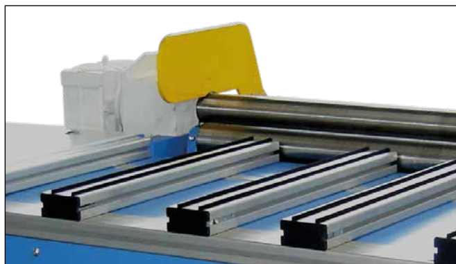
Tube ejector, pneumatically